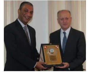
Current and upcoming ACINET Chairs

A high-level delegation from the Republic of Tunisia completed an official visit to Beirut, from 1 to 3 September 2014, upon the invitation of H.E. the Minister of Justice Major General Ashraf Rifi, Chair of the "Arab Anti-Corruption and Integrity Network" (ACINET) and with the support of UNDP's "Regional Project on Anti-Corruption and Integrity in the Arab Countries". The visit came in the framework of preparations for the transfer of ACINET's Chairmanship from the Republic of Lebanon represented by the Minister of Justice, to the Republic of Tunisia, represented by the Minister of State in charge of Governance and Public Function.