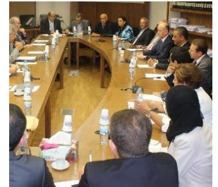
Similarity in legislative anti-corruption priorities

The delegation then met with the head of the Administration and Justice Committee and a number of its members and members of “Lebanese Parliamentarians against Corruption” where they discussed updates relating to anti-corruption legislative work in both countries and means to strengthen this work through bilateral and multilateral cooperation. During the second day, the delegation met with heads of oversight agencies in Lebanon (the Public Service Council, Court of Accounts, Central Inspection and the Higher Committee for Discipline) and analyzed the similarities and differences in the two oversight systems and exchanged views on ways to strengthen these systems within the framework of ACINET.