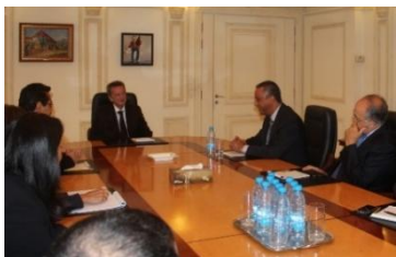
Discussions with the Governor of the Central Bank

The delegation also met with the Minister of State for Administrative Reform where an agreement was reached to establish bilateral cooperation on e-government; the ethics of public function and on administrative simplification with a view to limiting corruption risks. During the meeting with the Governor of the Central Bank and subsequently with the Secretary of the Special Investigation Committee, cooperation avenues were explored, namely with regards to asset recovery. The Tunisian delegation praised Lebanon's cooperation in this field considering it as exemplary for all other countries in the world.