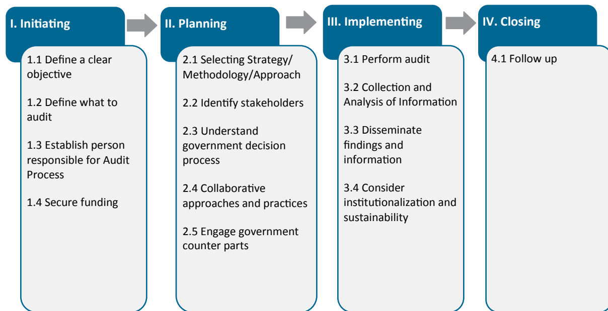
Figure 2: Illustrative Step by Step Process of Social Audits

Source: Compiled and summarized from an array of Manuals and Guides those have been produced all over the world to help replicate social audit experiences.